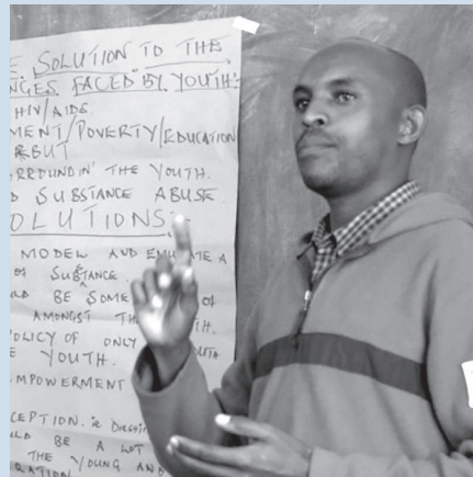
A grantee site visit.

Ford Foundation: The Ford Foundation's board of trustees just returned to Detroit, our birthplace, for the first time in more than half a century – and reconnecting with our roots reminds