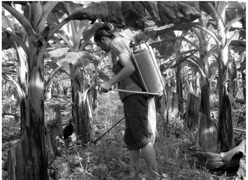
Chinese workers spraying Paraquat without proper protection.