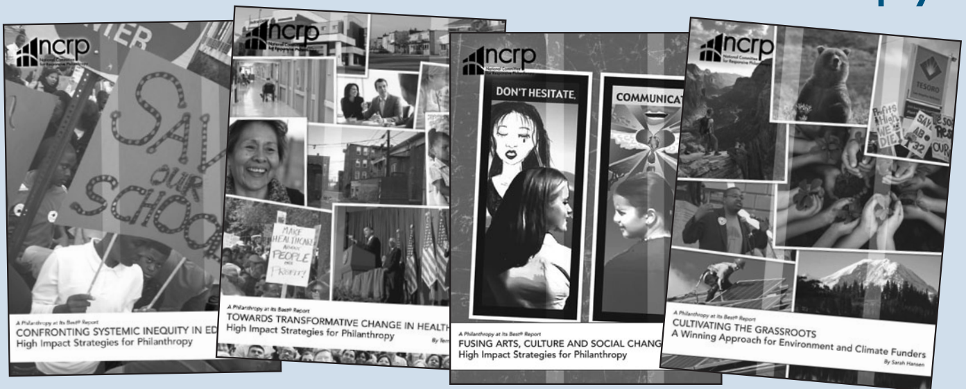
Confronting Systemic Inequity in Education