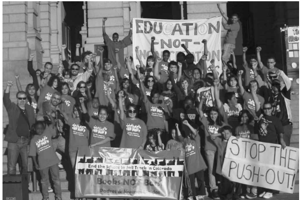
The Edward W. Hazen Foundation provides long-term support to parents and student groups working for education equity, including the Padres y Jovenes Unidos in Denver, CO.

Second, identify social problems that are clear symptoms of the social ills that conflict with those values, but don't stop there. Identify the root causes of those problems or you will achieve only temporary fixes, not sustainable solutions. With the grounding of racial justice as its moral center and self-determination as a guiding principle, the Hazen Foundation has provided long-term support to groups of parents and students concerned with the issue of educational inequity. Understanding that there are no simple solutions to this persistent problem, we support many