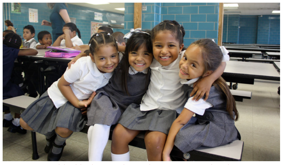
Prosperity Now mobilized local, state and regional partners to protect the Volunteer Income Tax Assistance (VITA) program in early 2017. VITA is a network of thousands of volunteers who help millions of low-income taxpayers access the Earned Income Tax Credit and the Child Tax Credit.

Founded in 2004 by Laurene Powell Jobs, Emerson Collective uses a wide variety of tools and strategies to achieve its mission of "removing barriers to opportunity so people can live to their full potential." While few of the elements that define Emerson's approach to partnership