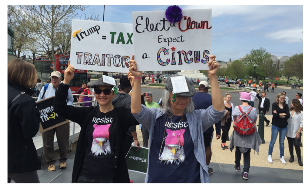
Protestors attending the DC Tax March in April 2017.

1. "Alt-right" is defined by Merriam Webster as "a right-wing, primarily online political movement or grouping based in the U.S. whose members reject mainstream conservative politics and espouse extremist beliefs and policies typically centered on ideas of white nationalism: "More at https://www.merriam-webster.com/dictionary/alt-right."