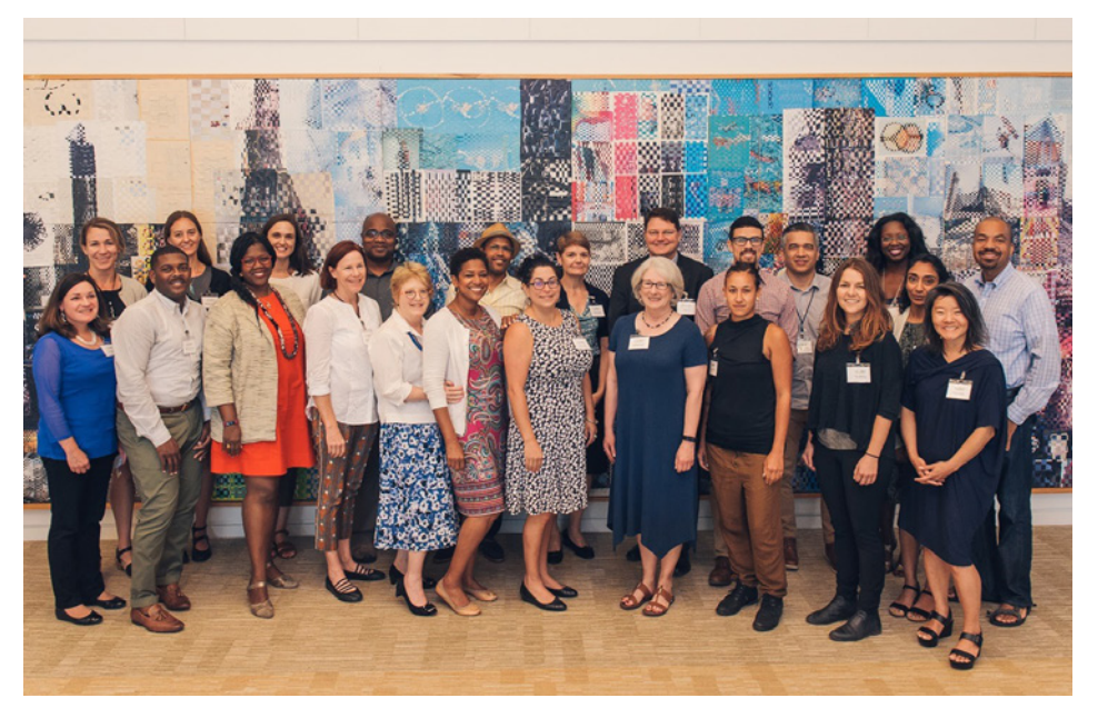
The 11th Hour Project joined other foundations around the country to address philanthropic inequities at the InDEEP professional development series in 2017.

As KHA continued to assess our wider operational practices and support Joe in setting benchmarks, it also continued to scan the field for best prac-