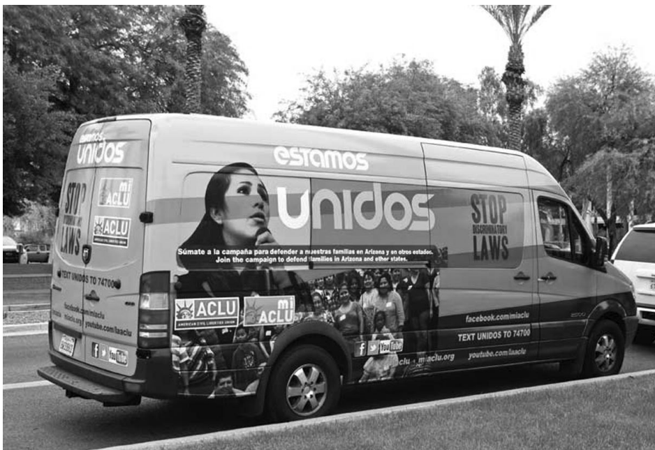
A project of Levi Strauss grantee, American Civil Liberties Union – Northern California.