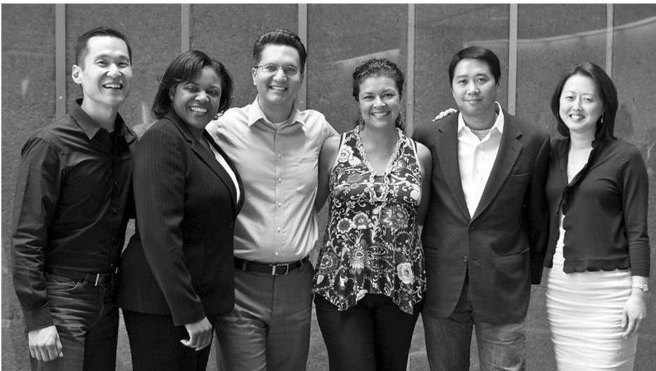
The author (left) stands with the five Pioneers.

Deeply connected to their communities, this new cadre of leaders recognized that new tactics, tools and