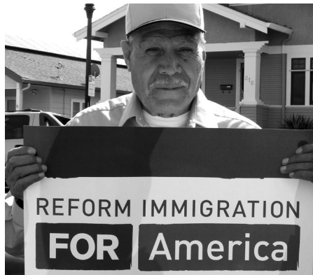
In Los Angeles and across the state, families, nonprofits and movement leaders intersect to demand new policies for immigrants living in California.

ate dean at Stanford Law School facilitated conversations where these leaders could negotiate policy goals and tactics and scope out areas of common interest.