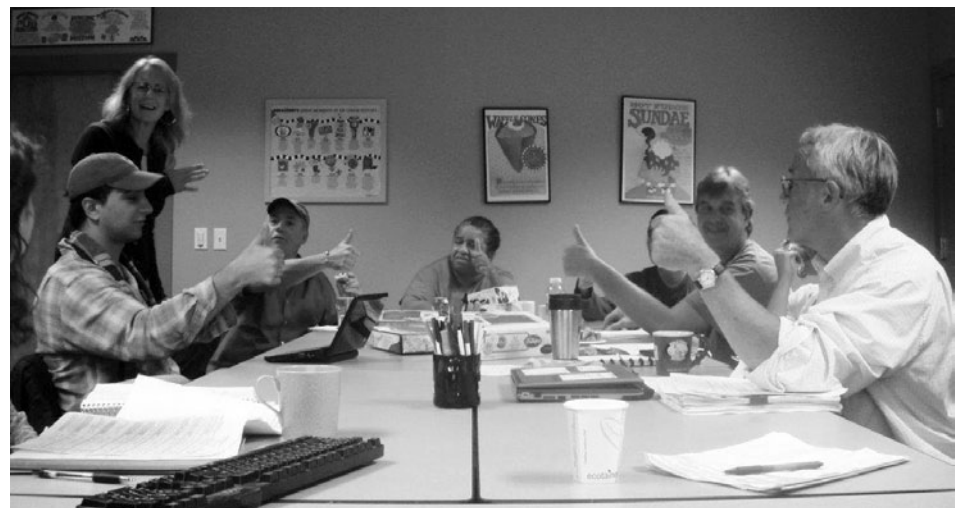
A "thumbs up/thumbs down" vote at an employee-led committee meeting.

Over the years, the trustees came to understand that the people most impacted by social problems are in the best position to determine the solutions. Therefore, the foundation began