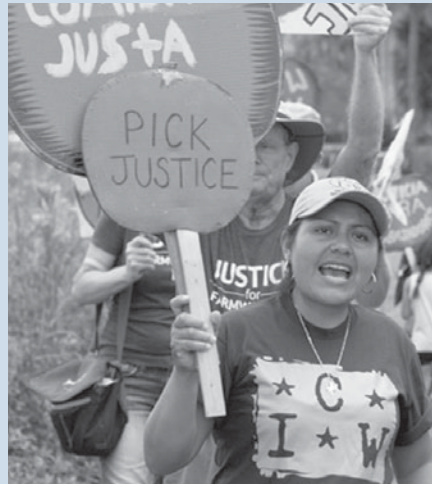
In August 2013, the Coalition of Immokalee Workers Women's Group protested outside Wendy's in Estero, Florida, accompanied by allies from the local Unitarian Universalist congregation.

A: The congregation's philanthropic strategies have changed somewhat over the 55 years that the UU Veatch Program has been making grants. During