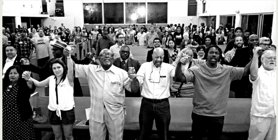
LA Voice leaders joining together in song at a criminal justice transformation town hall meeting.

Our work is especially relevant in this moment, where divisions of race, faith and class are being exacerbated and exploited by divisive leaders across the nation – including those in California. Beyond our organizing