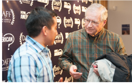
Film festival attendees talk at the first annual Define American Film Festival at the Des Moines Art Center in Des Moines, Iowa on Saturday, January 23, 2016.

According to a recent study commissioned by Unbound Philanthropy in 2018, these anti-immigrant groups have activated a conservative base that believes immigration, legal and illegal, is the number one threat to America today. Meanwhile, among segments of the population that are the most pro-immigrant, the issue of immigration itself falls to seventh or eighth on their list of priorities compared with other concerns.