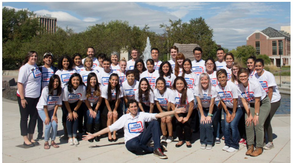
Members and leaders of Define American Chapters at the first chapters summit at the University of Nebraska-Lincoln. Define American Chapters are student-led initiatives to bring the conversation on immigrants and identity home to their college communities. Students receive the tools to reach out to people who have different opinions and backgrounds, and create opportunities for mutual understanding.

Since the 2008 election of President Obama, America's first non-white president, these groups have grown an average of 12 percent annually, with the largest of these (FAIR) growing its operating revenue by 73 percent between 2014 and 2016, alone despite being labeled as hate groups by the Southern