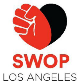
The SWOP Los Angeles logo, which is in the form of a heart with a red hand making a fist on the left side and a heart in the color black on the right. The text "SWOP LOS ANGELES" is directly under the shape of the heart.

SWOP LA is dedicated to the safety of sex workers and decriminalization of sex work. The criminalization of sex work keeps all of us down and compromises the safety of those of us working in the sex trade. Currently, our community members do not have equal access to social services, health care and resources to navigate the legal system. We cannot feel free to report violence done against us without fear of potentially being arrested ourselves, losing our housing or having our children taken away. Decriminalization gives workers choice and a voice in this world and allows us to exercise control and autonomy over our own bodies. However,