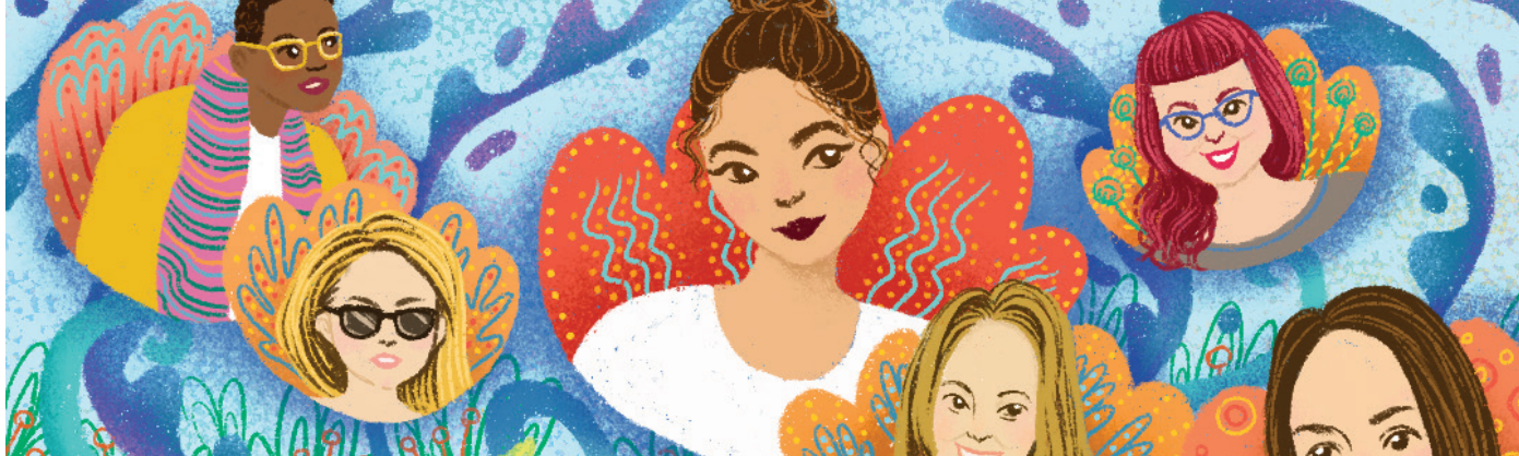
This beautiful piece was created by Amira Lin and commissioned as a gift to our collective by M. Sabal, Alisha's pen pal and comrade. It is a brightly colored digital illustration of our core collective members set in an abstract under the sea scene. Each of our members is shown in portrait from the torso or shoulders up in stylized seashell or coral vignettes. Beautiful sea grasses and kelps swirl around the whole drawing.

Kaba's work discussing Black women and femmes in particular not having a self to defend and being criminalized for acts of survival in our white supremacist society) or being interpreted and ignored as being messy, dramatic, "not worth the effort or cost," and ultimately not worth listening to, directly resourcing, respecting or protecting. This then translates into silencing, erasing, caging, deporting, and killing. These are not buzz words, these are life-and-death scenarios for folks in the sex trades.