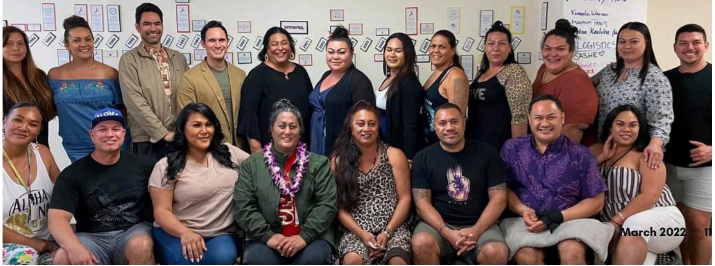
Ka Aha Mahu, trans leaders across the Hawaiian Islands, meet to share and discuss topics that affect trans people on their islands.

tents and supplies for our unsheltered homeless participants.