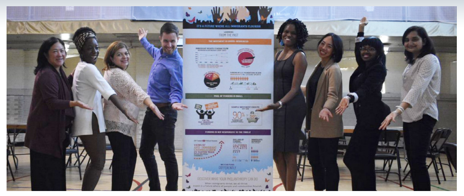
In 2019, NCRP unveiled its Movement Investment Project, dedicated to encouraging foundations and wealthy donors to move money to grassroots social movements.

that for every dollar invested in organizing and advocacy, communities reaped $115 in benefits. The summary report from that series, Le veraging Limited Dollars ,<sup>9</sup> has been used by hundreds of foundations to protect or expand their funding for these strategies that help people who have been oppressed fight for justice and liberation.