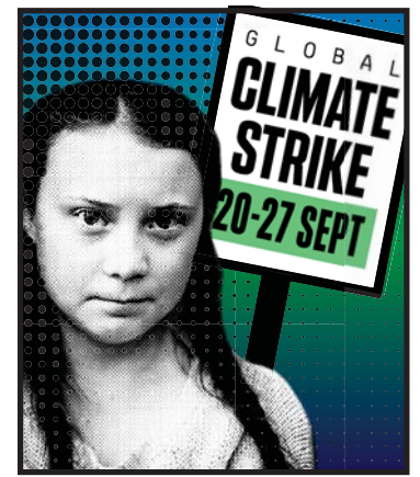
2019 GLOBAL CLIMATE STRIKE