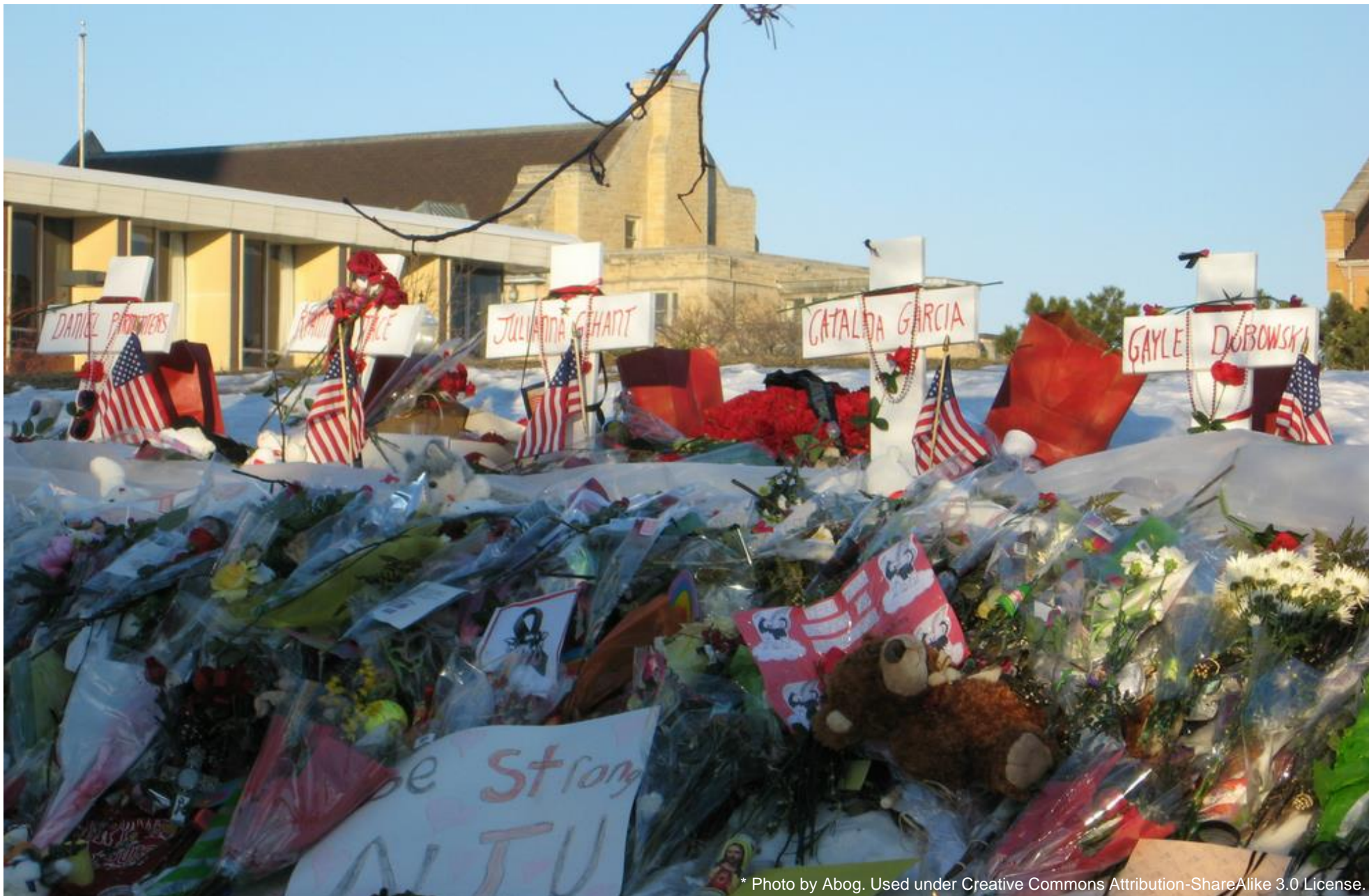
* Photo by Abog. Used under Creative Commons Attribution-ShareAlike 3.0 License.