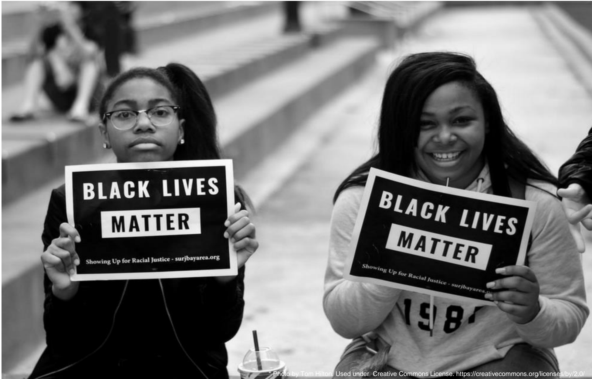
* Photo by Tom Hilton. Used under Creative Commons License. https://creativecommons.org/licenses/by/2.0/